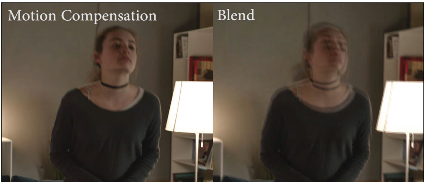
Motion-Compensated Interpolation on the left; Blend on the right. Note the ghosting on the right.

So, we currently have 24 frames per second, and we need 60. The three methods all use different techniques to create those extra 36 frames per second. Here's a brief description.